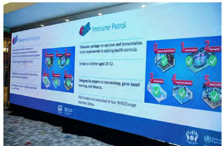
The next step is to pilot the platform in selected schools and gather insights before full integration.